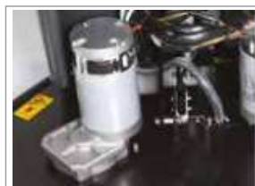
HIGH QUALITY MOTOR GEAR BOX