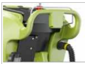
NEW ERGONOMIC HANDLE