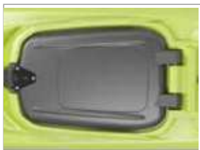
NEW LARGE COVER