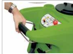
BRUSH CONTROL WITH AUTOMATIC DELAYED STOP