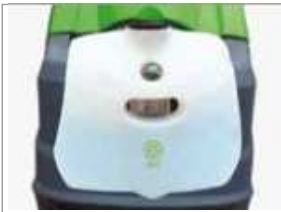
SEPARATE DETERGENT DOSING SYSTEM (OPTIONAL)