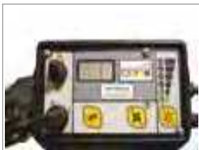
INTUITIVE CONTROL PANEL