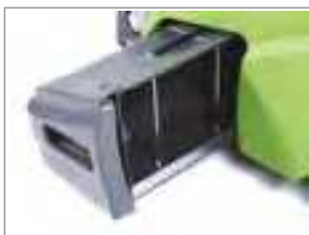
FRONTAL WASTE TRAY