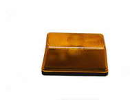
FLASHING LIGHT KIT KTRI01770